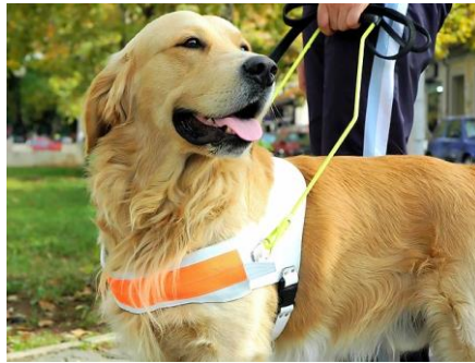
Pictured above: Not Riley 😊

https://www.youtube.com/watch?v=fsspNWKUfFU www.patspets.ca